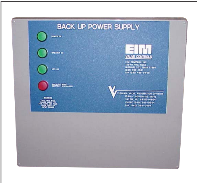
Private Label BUPS