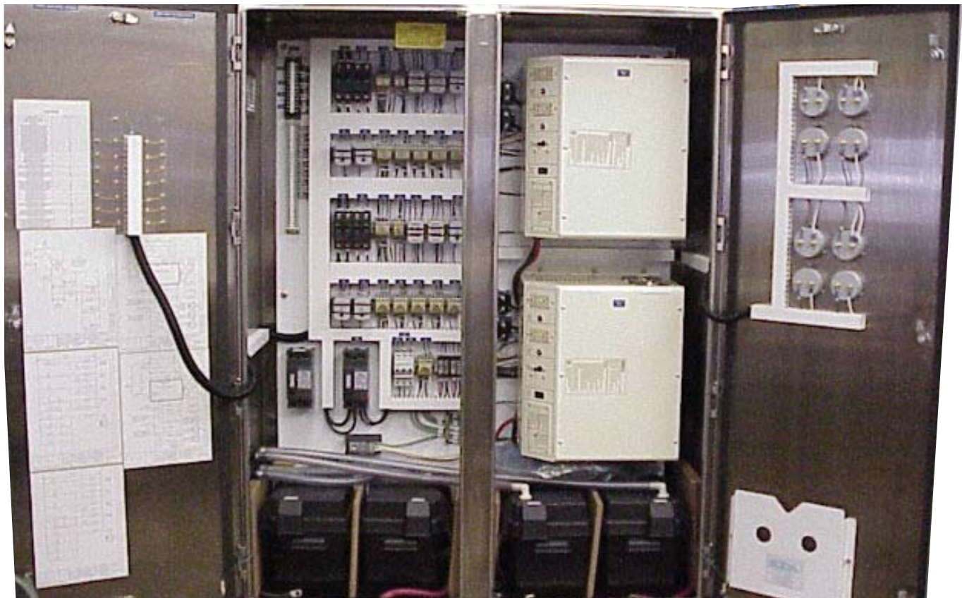
Custom BUPS to power four actuators