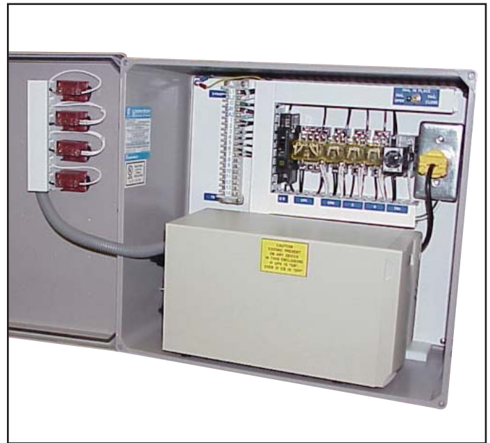
Custom private label layout