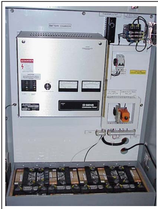
Custom BUPS to power 3 phase actuator

The Virginia Valve series BUPS shall be properly sized such that it will satisfy and complete all fail safe conditions at full power. The series BUPS shall be suitable for 120VAC, 60Hz input power to maintain the Advanced Battery Management System (ABM). The BUPS shall be electrically isolatable, equipped with input and output circuit breakers, and properly sized according to the application. All equipment within the BUPS shall be standard, state of the art industrial components. There shall be a customer adjustable timer integral to the BUPS that will filter out any nuisance faults. Batteries in the BUPS shall be of the sealed, maintenance free type. Vented lead-acid (Antimony) flooded electrolyte batteries are not acceptable. Recharge time for the system shall not exceed six hours. The series BUPS shall effectively operate within the temperature range of 32-104 degrees F (0-40 degrees C). On-line efficiency shall be greater than 96%. Output frequency distortion shall be less than +/- 0.5%. Using a Buck / Boost output voltage system, output voltage shall not exceed +/- 5% of nominal voltage.