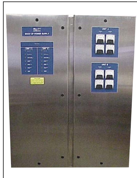
Custom two station BUPS

Virginia Valve, 1390-C Southside Drive Salem, VA 24153-4604 Phone: 540-389-0364 Fax: 540-289-0494 www.virginia-valve.com E-mail: marketing@virginia-valves.com